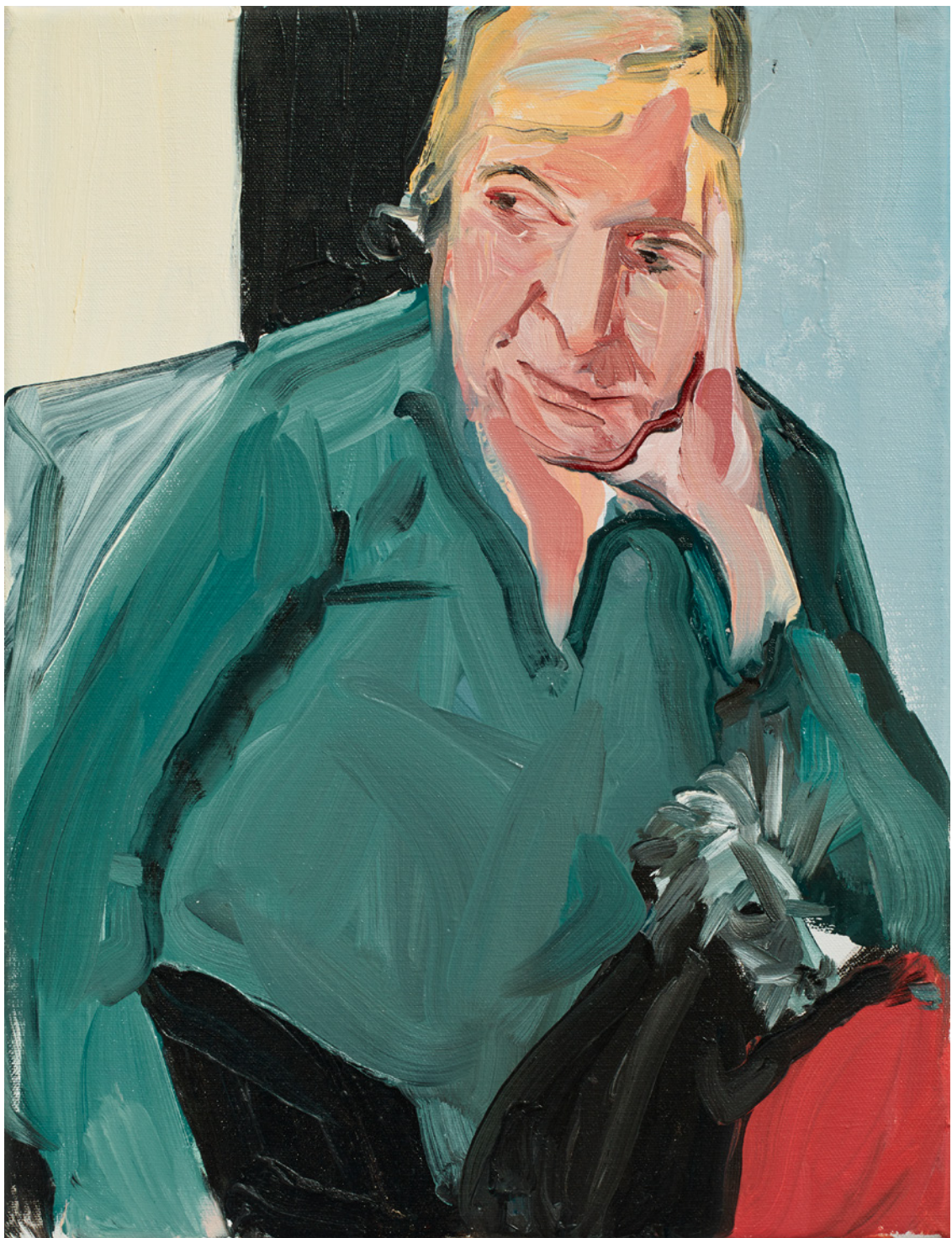
Chantal Joffe My Mother with Fern , 2017, Oil on canvas, 40.8 x 31.3 cm © The artist