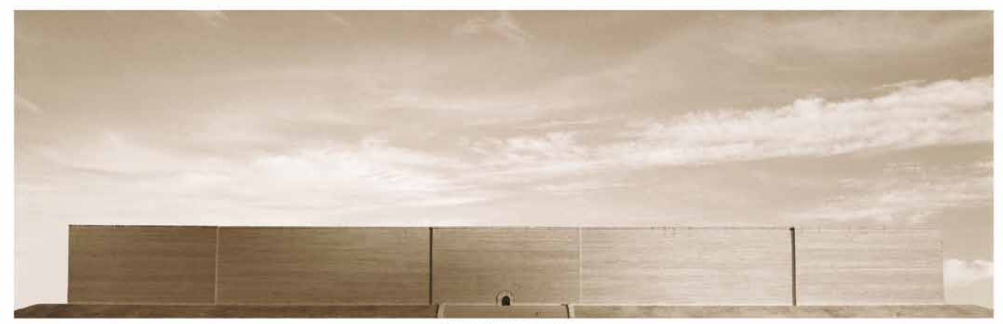
WARREST BARREST TALLER