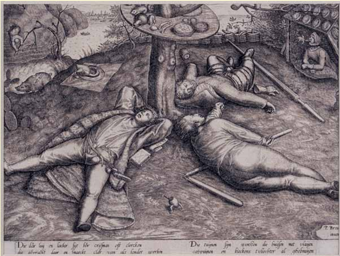
Pieter van der Heyden (after Pieter Bruegel) Land of Cockaigne , 1567 Engraving 20.1 x 26.6 cm Collection Irish Museum of Modern Art Donation, Madden / Arnholz Collection, 1989