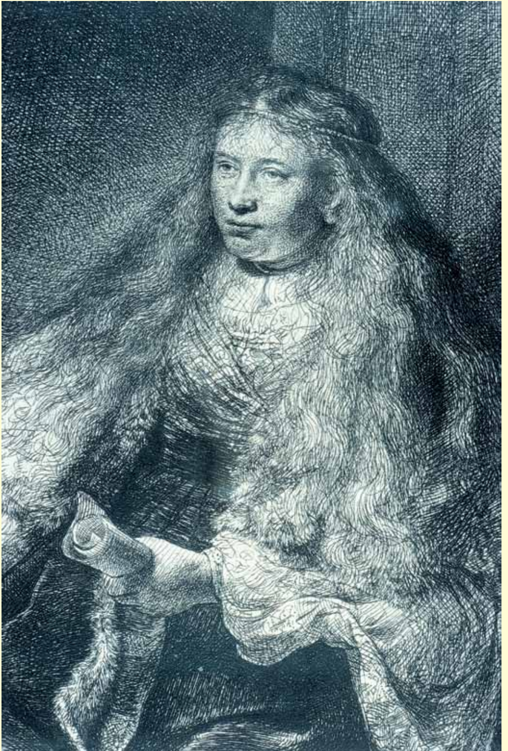
Rembrandt van Rijn The Great Jewish Bride , 1635 Etching 21.3 x 6.2 cm Collection Irish Museum of Modern Art Donation, Madden / Arnholz Collection, 1989