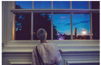
IMAGE TOP: Reflection (Self Portrait) detail, 1985 / oil on canvas / Freud, Lucian (1922–2011) / Private Collection

IMAGE BOTTOM: Summer Party at IMMA / 2014