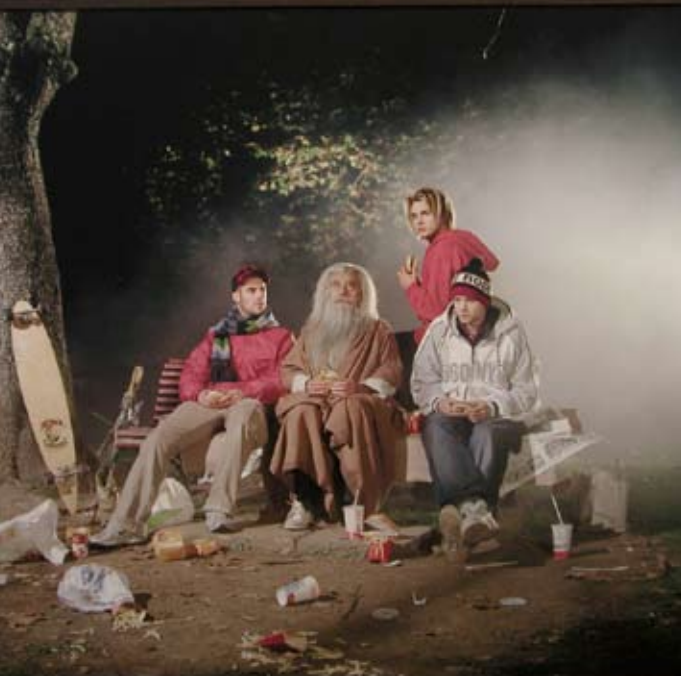
Carles Congost, Revolutionary 2 , 2004, Colour photograph, 160 x 140 cm, Courtesy Arte Ricambi Gallery and Collection Tengattini/Campedelli

A fully-illustrated publication accompanies the exhibition (price €49.00).