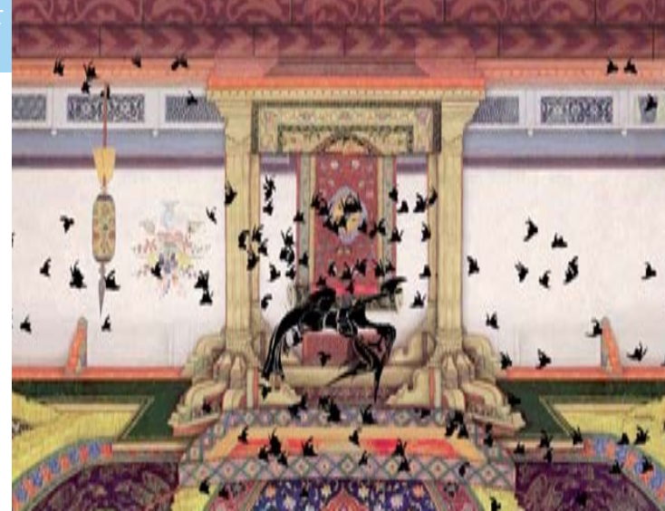
Shahzia Sikander, Spi/N , 2003, still from 6 1/2 minute video, DVD installation variable, Courtesy Sikkema Jenkins & Co

A publication accompanies the exhibition.