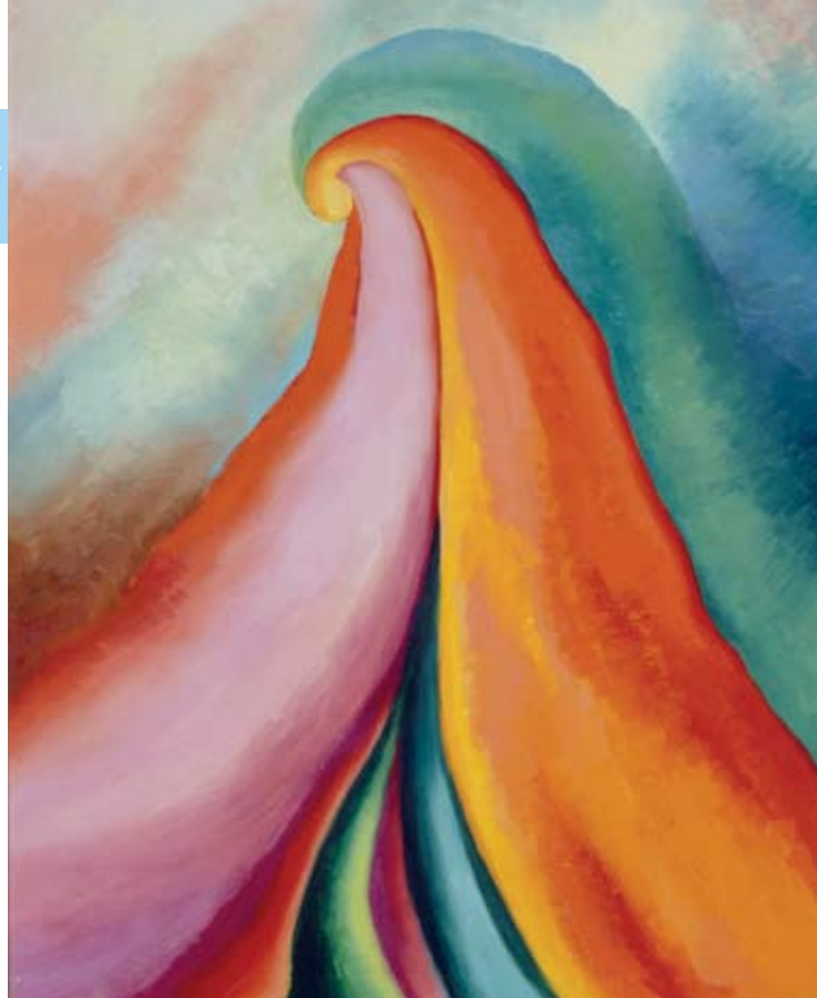
Georgia O'Keeffe, Series 1, No 4 , 1918, Courtesy Städtische Galerie im Lenbachhaus, Munich