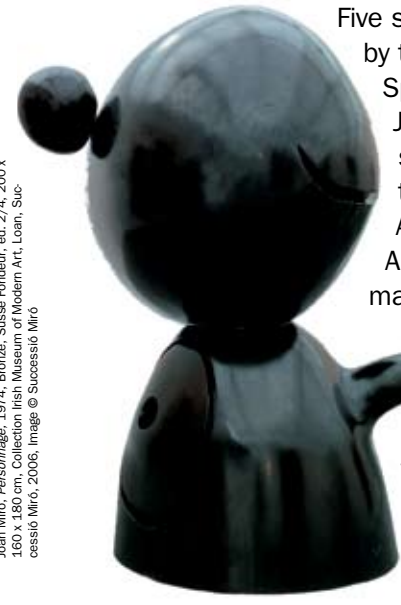
Joan Miró, Personage , 1974, Bronze, Suisse Fondeur, ed. 2/4, 200 x 160 x 130 cm, Collection Irish Museum of Modern Art, Loan, Successió Miró, 2006

Five sculptural works by the renowned Spanish sculptor Joan Miró and five sculptural mobiles by the equally famous American sculptor Alexander Calder make up this exhibition in IMMA's courtyard. It derives from the close working relationship between the two artists from the 1920s and '30s right up to the time