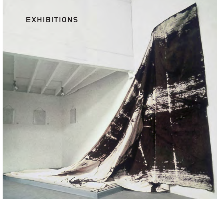
IMAGE Coast-Lines installation photo / IMMA 2017