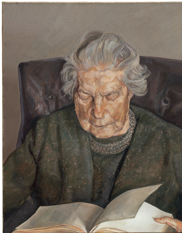
Lucien Freud The Painter's Mother Reading, 1975

information and resources for students and teachers