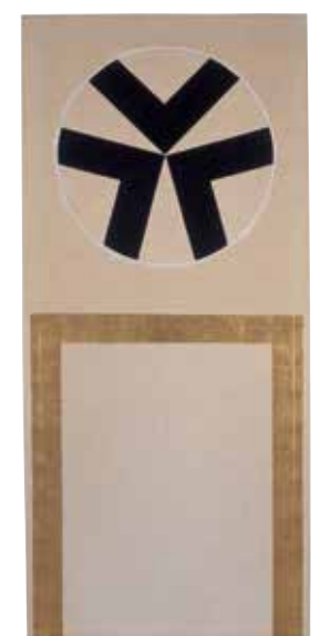
Patrick Scott, Gold Painting 47, 1969, Oil and gold leaf on linen, 178.2 x 81.8 cm, Collection Irish Museum of Modern Art, Donation, Gordon Lambert Trust, 1992

The Artists' Residency Programme is re-commencing in January 2014 when we bring artists back to live and work onsite at IMMA. For further details visit www.imma.ie