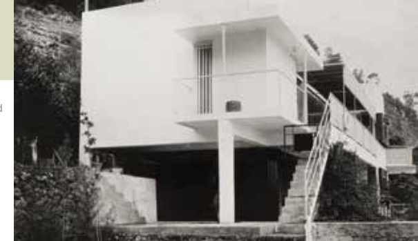
View of the garden façade of E1027, 1926-29. This was Gray's first completed domestic architectural project.

Gray's work has often been split into two parts by critics, with decorative arts on the one hand and architectural modernism on the other. This exhibition approaches Gray's work as a whole, engaging, as she did, in drawing, painting, lacquering, interior decorating, architecture and photography. Renowned in France during the early decades of the 20th-century as a designer in lacquer furniture and interiors, Gray began to experiment with architecture in the late 1920s. The exhibition includes lacquer work, several of her carpet designs, samples from her Paris shop Jean Désert and key items of furniture from her work on the apartment of Madame Mathieu Levy and Gray's own home, Tempe à Pailla .