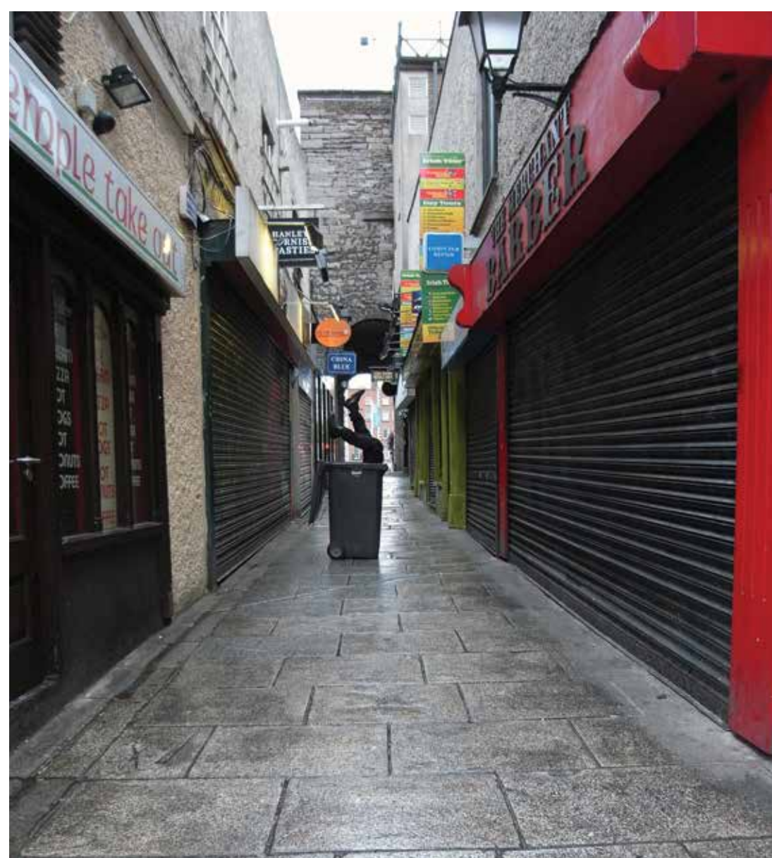
Klara Lidén, Merchants Arch , 2013, C-print, 60 x 45 cm