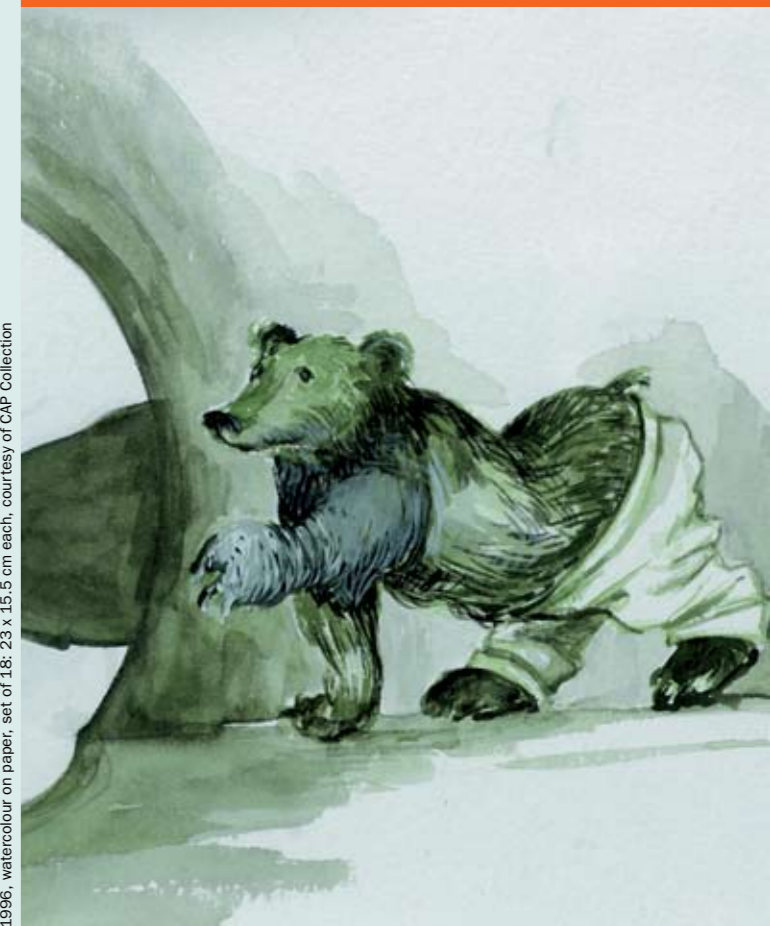
Kara Walker, untitled watercolour from the series Negress Notes (Set 2) , (detail), 1996, watercolour on paper, set of 18: 23 x 15.5 cm each, courtesy of CAP Collection