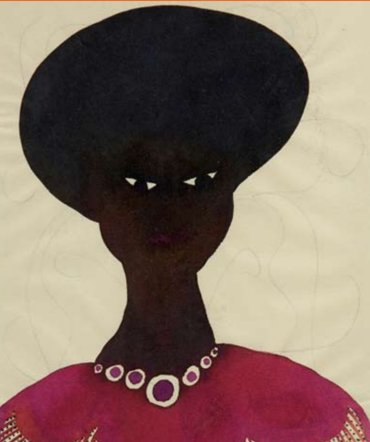
Chris Ofili, Untitled (detail), c. 1999, 31.5 x 23 cm, watercolour on paper, series of 2