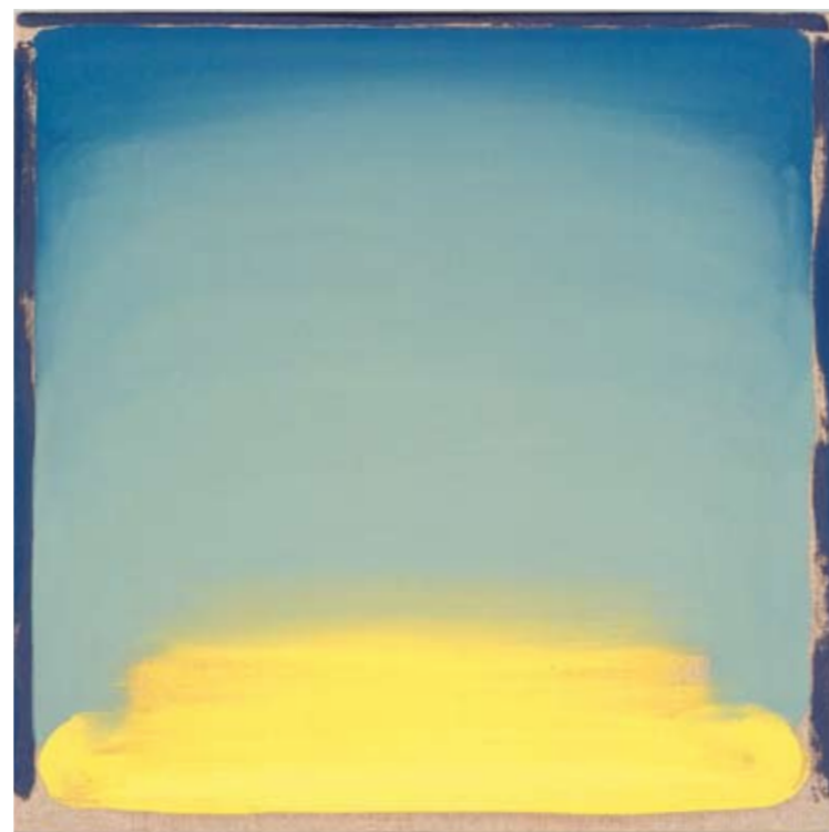
William McKeown, The Field (Turning Buttercups) , 2008, Oil on linen, 43 x 43 cm

This exhibition comprises paintings, watercolours and drawings by William McKeown, one of Ireland's most highly