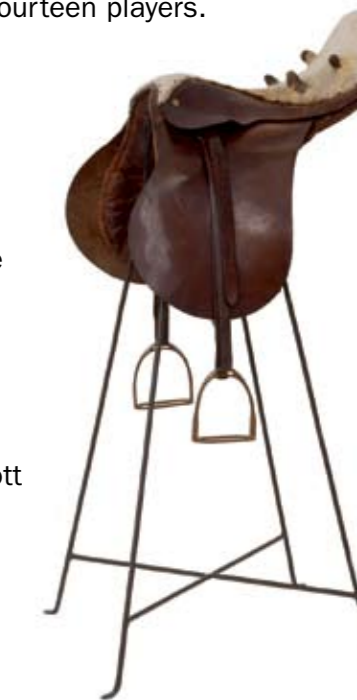
Dorothy Cross, Saddle , 1993, Saddle, cow's udder, metal stand, 118 x 56 x 56 cm, Collection Irish Museum of Modern Art, Purchase, 1991

Also on show are some 10 works from the IMMA Collection by the internationally-acclaimed Irish artist Patrick Scott alongside the newly acquired painting Titian's Robe , 2008, by the celebrated Irish artist Sean Scully.