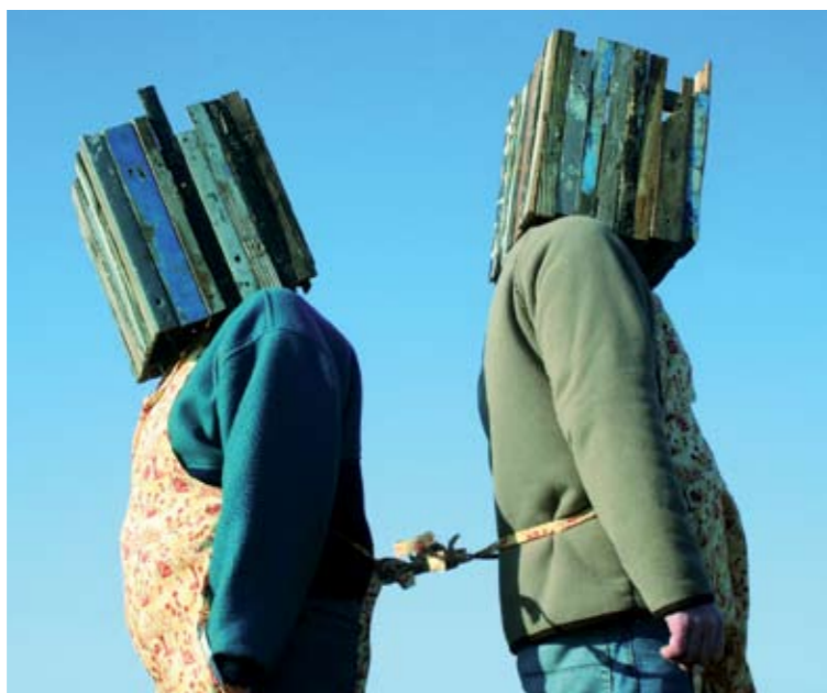
Aoife Geary, Ulach Dosheachanta (Imminence) , 2006, digital print on board, 65.5 x 53 cm, NUI Galway Collection

A fully-illustrated publication accompanies the exhibition.