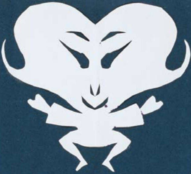
Hans Christian Andersen, Fantasy with Large Head , 1859, paper cut-outs on picture book (Laarge Petersen Collection no. 658), 8.5 x 9.5 cm, The Royal Library, Copenhagen