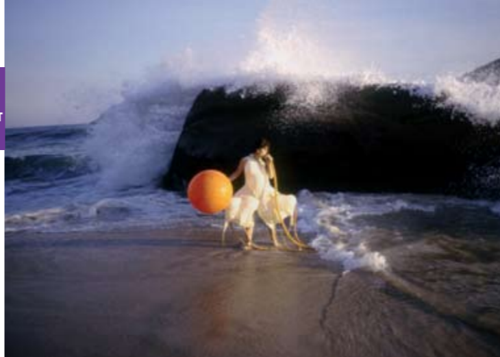
Janaina Tschäpe, Dani 1 , 2003, Cibachrome, 40 x 50 inches, Private Collection