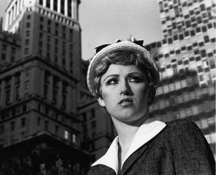
Cindy Sherman. American, born 1954, Untitled Film Still #21 , 1978, Gelatin silver print, 7 1/2 x 9 1/2 (19.1 x 24.1 cm), The Museum of Modern Art, New York. Horace W. Goldsmith Fund through Robert B. Menschel, © 2009 Cindy Sherman