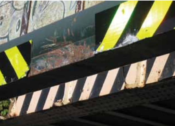
Anne Tallentire, Nowhere else , 2010, digitally interactive double screen video projection, wall chart, chart for distribution (detail projected image no. 02 february_11 _geofish_ capricornus_11atchmere, 240cm x 180cm), Courtesy of the artist

A fully-illustrated publication accompanies this exhibition.