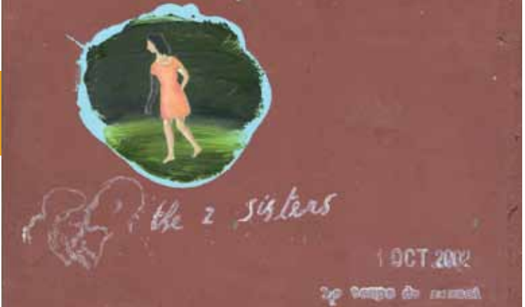
Francis Alÿs, Le Temps du Sommeil , 1996 – present, series of 100 paintings (ongoing), oil and pencil on wood, 12 x 16 cm

the 20 th -century. In 1967 he curated Six Painters which included work by Piet Mondrian, Philip Guston, Franz Kline, Willem de Kooning, Jackson Pollock and Mark Rothko. Vertical Thoughts takes its inspiration from Feldman's original project; the exhibition comprises music scores, record covers, photographs, and works from Feldman's own Collection, including a number of oriental rugs. Also presented is a programme of related events, including a concert of Feldman's music.