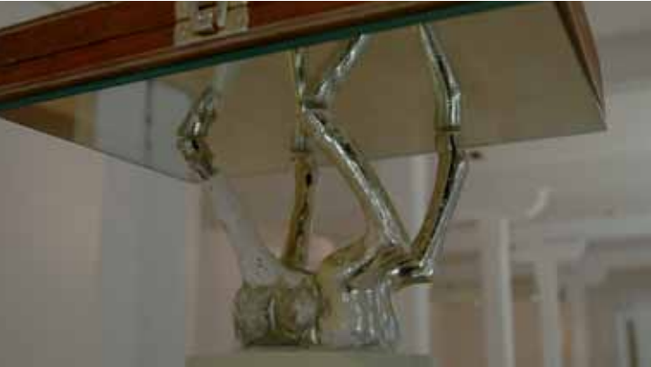
Linda Quinlan, It adds to the confusion 3, 2006, 1950s haslev Table, resin, ceramic, mirror, gold-leaf and watercolour paint box, 80 x 34 x 48 cm, IMMA Collection, Purchase 2006, © Linda Quinlan

since 1994. This significant collection of British sculpture and drawings of the 1980s and '90s will return to the Weltkunst Foundation in 2010 and this exhibition acknowledges the generous loan of these works.