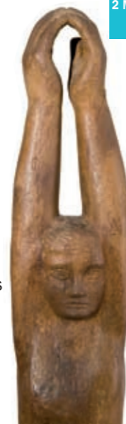
James McKenna, Eamonn an Cnoic Ascending into Dublin , detail, 1970, New, 140 x 14 x 13 cm, Private Collection

A publication accompanies the exhibition. Price €35.00.