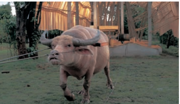
Philippe Parreno, The Boy From Mars , 2003, 35mm transferred to High Definition video, Dolby Digital 5.0 stereo with musical score by Devendra Banhart, Edition 3 of 4, 11min 40sec, Collection Irish Museum of Modern Art