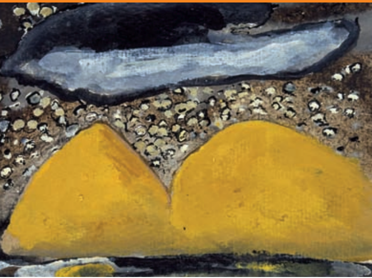
Patrick Hall, The Sky is Full of People , 2007, ink and watercolour on paper, 13 x 14 cm, Collection of the artist