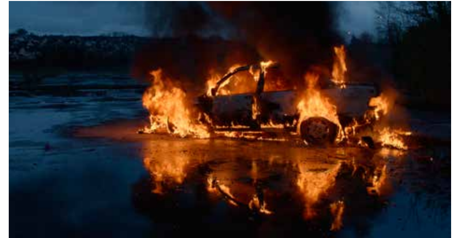
IMAGE Grace Weir / A Reflection on Light (film still), 2015 / HD Video / 20 minutes

Collection Exhibitions / Garden Galleries