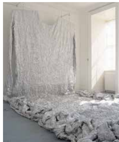
IMAGE Light Rhythms , installation view IMMA, 2014

Light Rhythms is an exhibition about sound, light and line that is activated by families and young people of all ages.