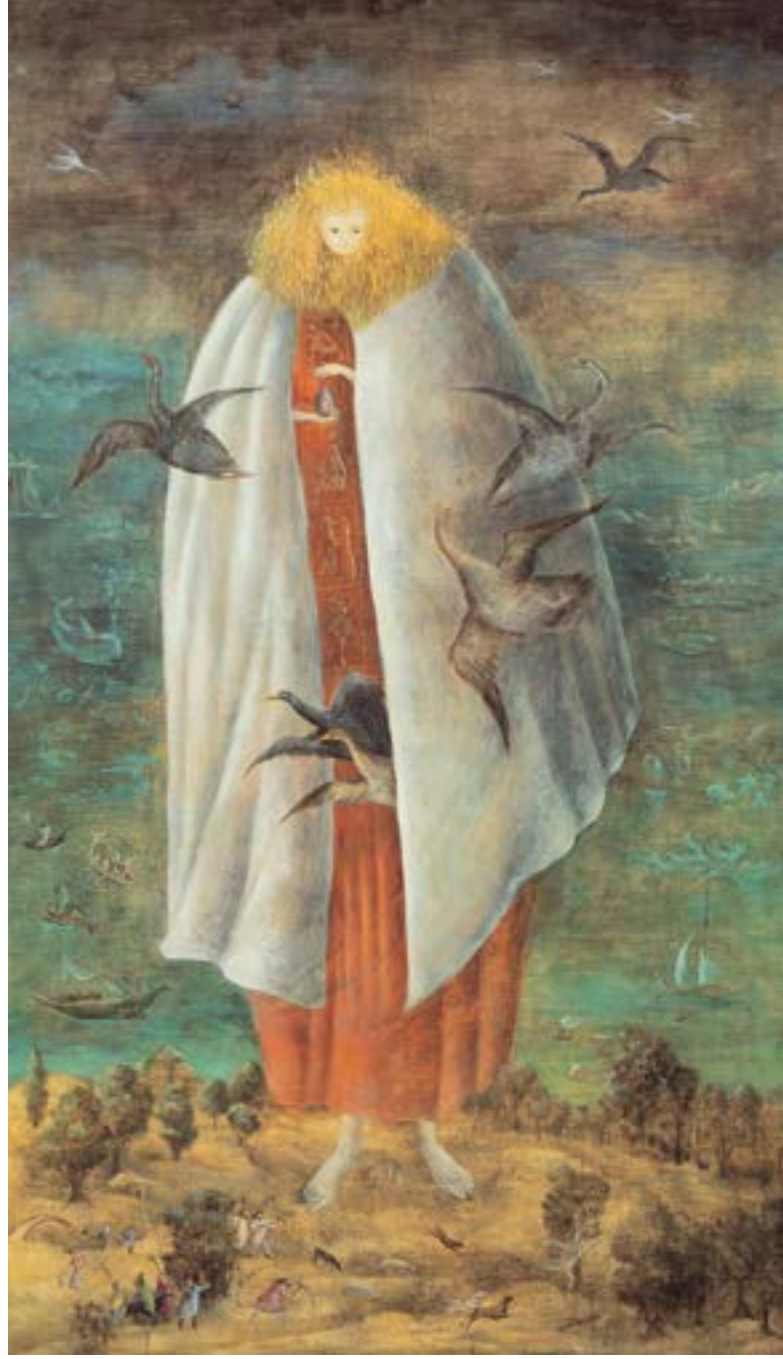
Leonora Carrington, The Giantess , 1947 circa, Tempera on wood panel, 117 x 68 cm, Private Collection, Mexico