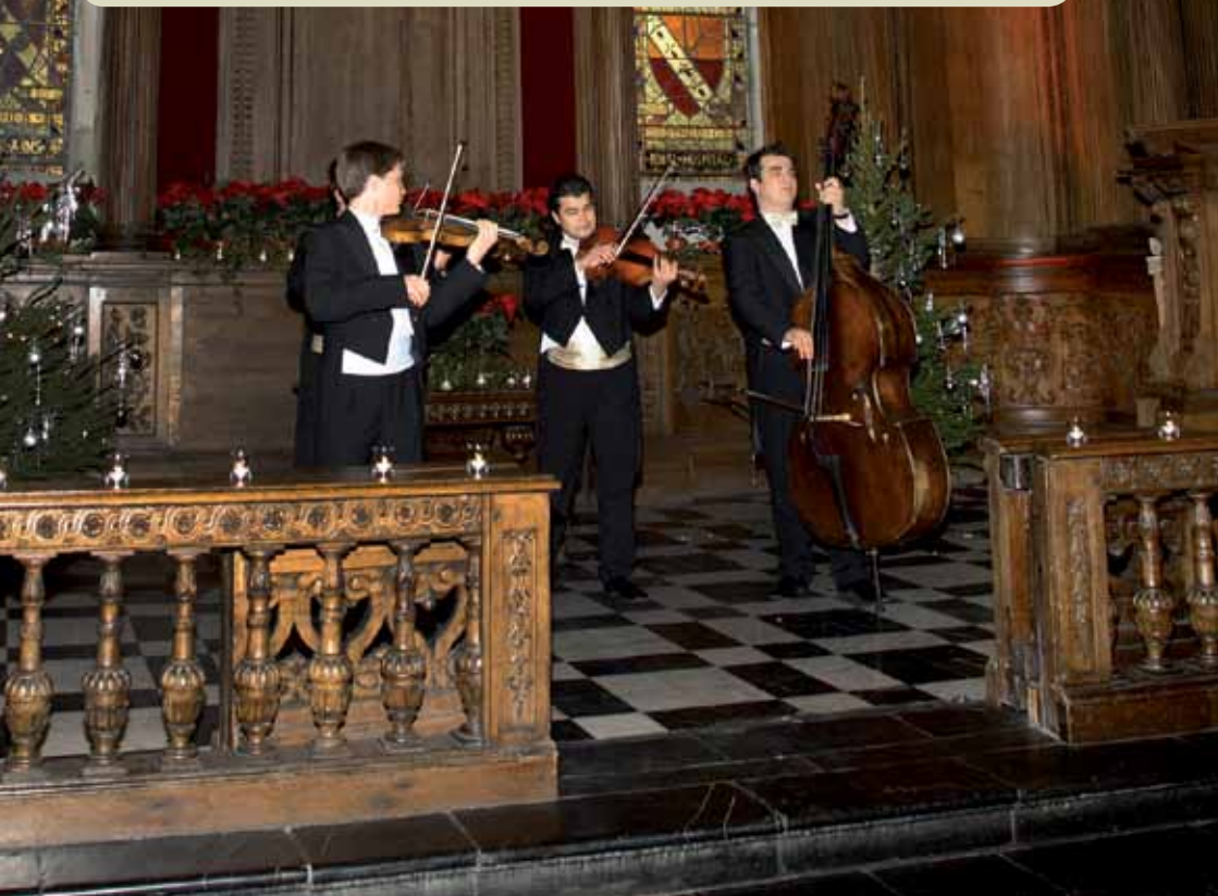
The Baroque Chapel

Have your event at the splendid Royal Hospital Kilmainham