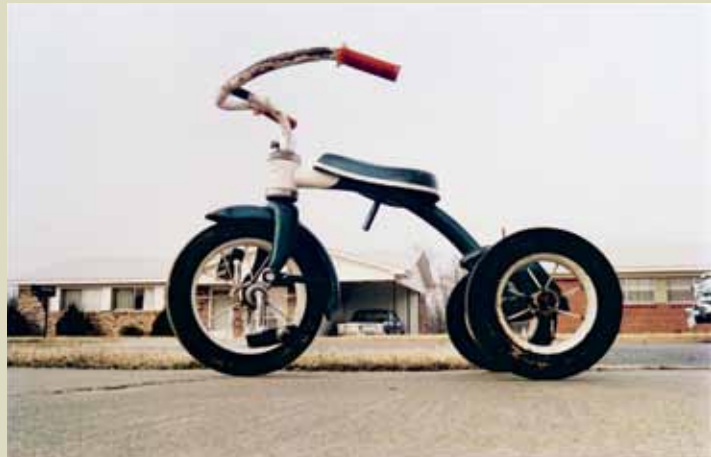
William Eggleston, Untitled (Memphis) , c.1970, Dye transfer print, 51.4 x 61.6 cm, ©Eggleston Artistic Trust, Courtesy Cheim & Read, New York

A catalogue accompanies the exhibition (Price €25.00).