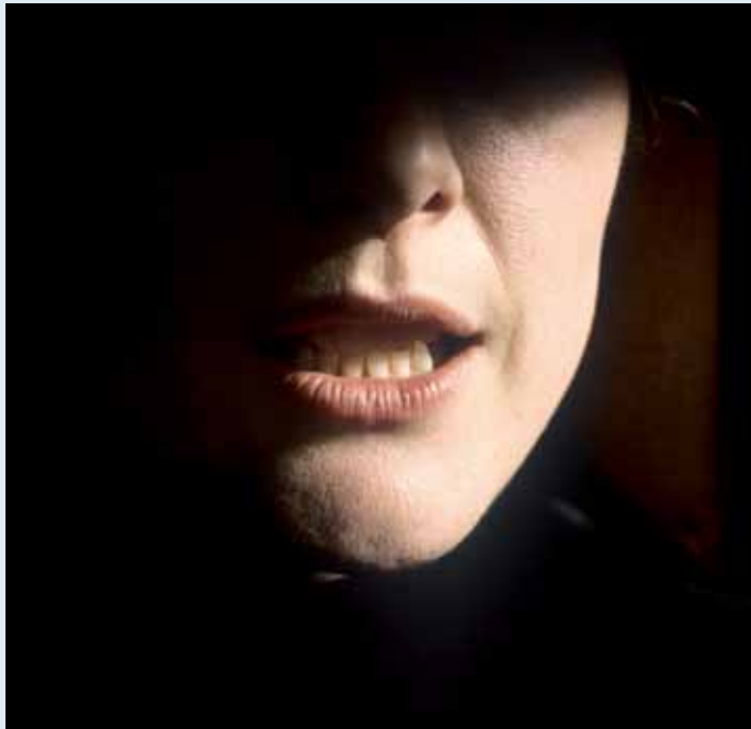
Neil Jordan, Not I, 2000, 6 screen video installation from film directed by Neil Jordan, Produced by Blue Angel Films, Dimensions variable, Collection Irish Museum of Modern Art, Gift, the artist, 2000.

Not I was donated to IMMA by Neil Jordan in 2000.