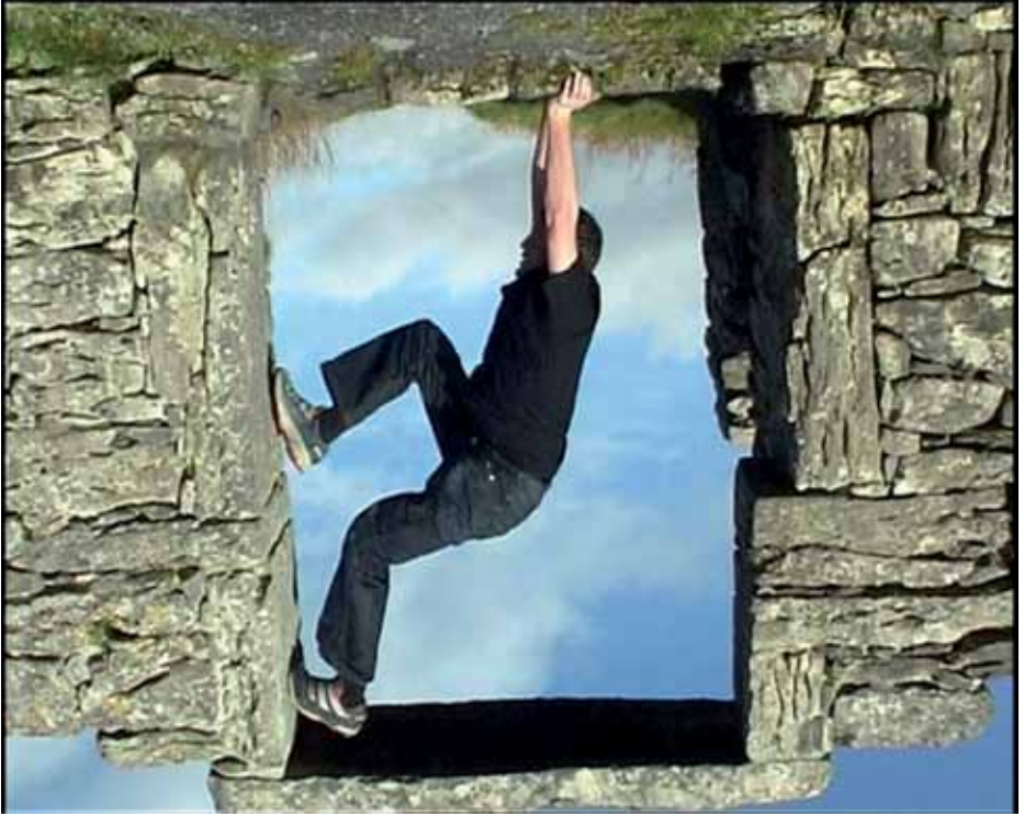
Brian Duggan, Door , 2005, Digital video, Edition 2 of 3, Dimensions variable, aspect ratio 4:3, Duration 1min 39 secs, Collection Irish Museum of Modern Art, Purchase, 2006, Digital still image courtesy the artist and IMMA