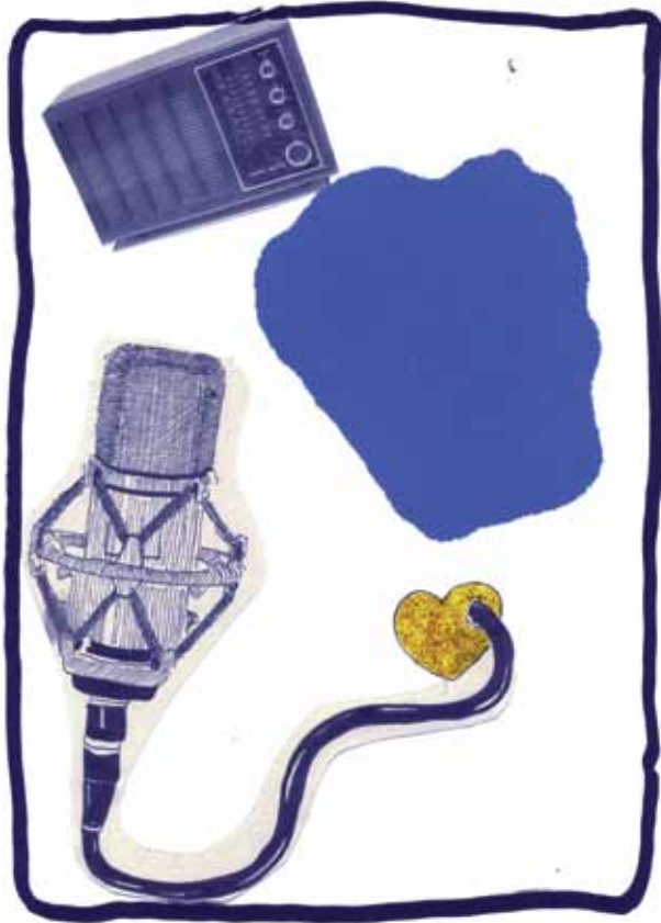
Garrett Phelan, NEW FAITH LOVE SONG 4 , Collage Drawing, Ink, Glitter Paint, Collage, 21cm X 29.5cm, February 2012